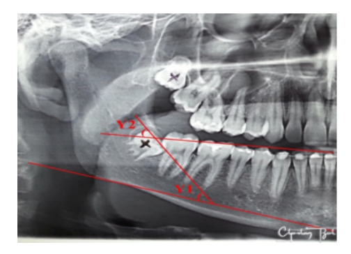
Fig.1. Richardson measurements