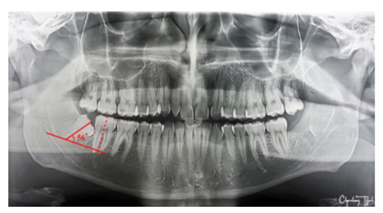
Fig.3. The angle between the longitudinal axis of the lower third molar and the longitudinal axis of the second molar